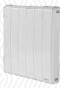
Q-Rad Electric Radiator