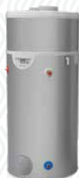
Edel Hot Water Heat Pump