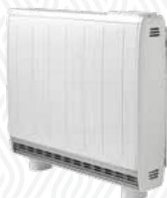
Quantum HHR Storage Heater