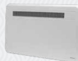
LSTE Panel Heater