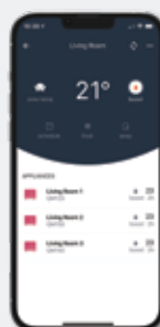
The Dimplex Control App

Control and monitor your heating and hot water with Dimplex Control. Group heaters into zones to easily control and track their energy usage. Any time. Anywhere.