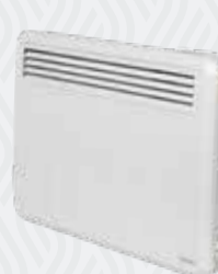
PLXE Panel Heater